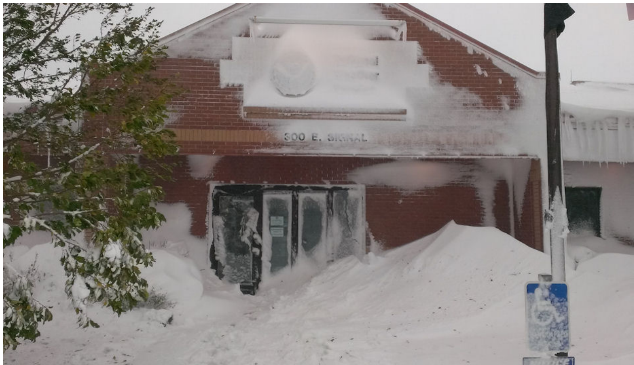
Fig 3: Snow in front of the Weather Forecast Office in Rapid City, SD