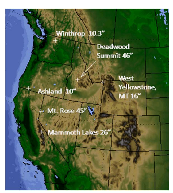
Figure 2. Map of maximum snowfall locations and amounts in each of the affected states.

Impacts: The long duration of the entire event from multiple systems resulted in copious amount of precipitation across a wide area of the West. This included reports of snowfall totals greater than 40 inches at a couple of mountainous locations in northern California and Idaho (fig. 2). There were also unconfirmed reports of more than 5 feet of snow in the high Sierra! Some of the lower elevations in northern California received over 20 inches of rain resulting in sudden rise of water in rivers and streams! Over 15 inches of rain fell in parts of Oregon and Washington as In addition to heavy precipitation, well. hurricane force wind gusts up to 150 mph were recorded in the mountainous terrain of California, Montana, Neva, Oregon, and Utah. There were no known reports of injuries or casualties directly related to the storms.