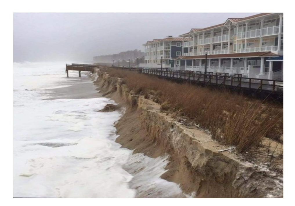
Figure 3: Erosion on Bethany Beach, DE (courtesy of Alex Liggitt, @ABC7Alex).