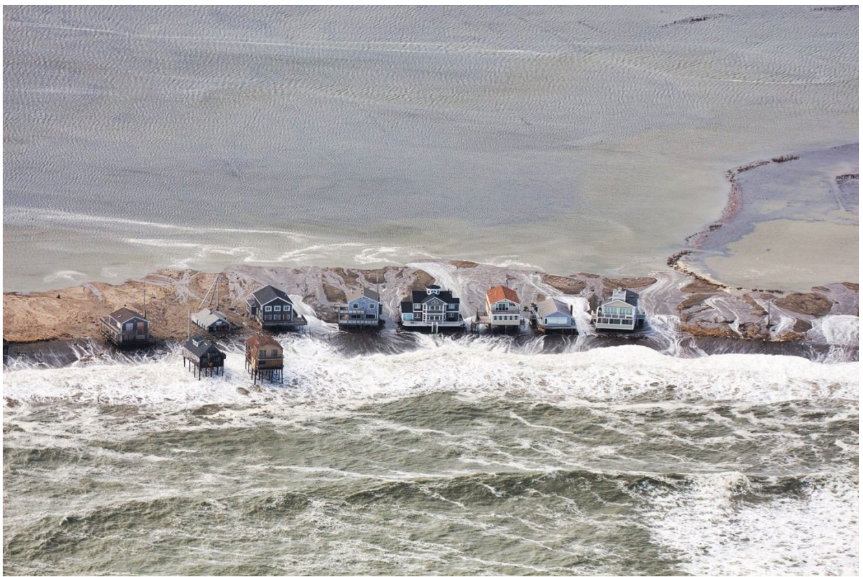
Fig. 2 – Coastal flooding in Peggotty Beach, Scituate, MA on 04 March