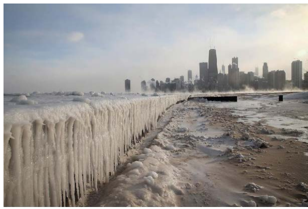
Figure 2: Photograph of Lake Michigan during the height of the arctic intrusion